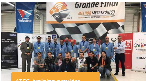
ATEC, training provider, Portugal