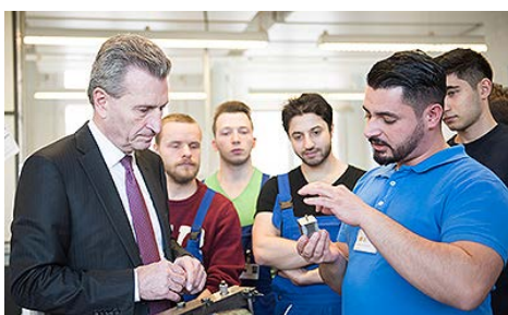
EU Commissioner Günther Oettinger and apprentices, Siemens Training Center, Germany

**The number of times that users have seen posts containing the hashtag, keyword, URL, and/or mention*